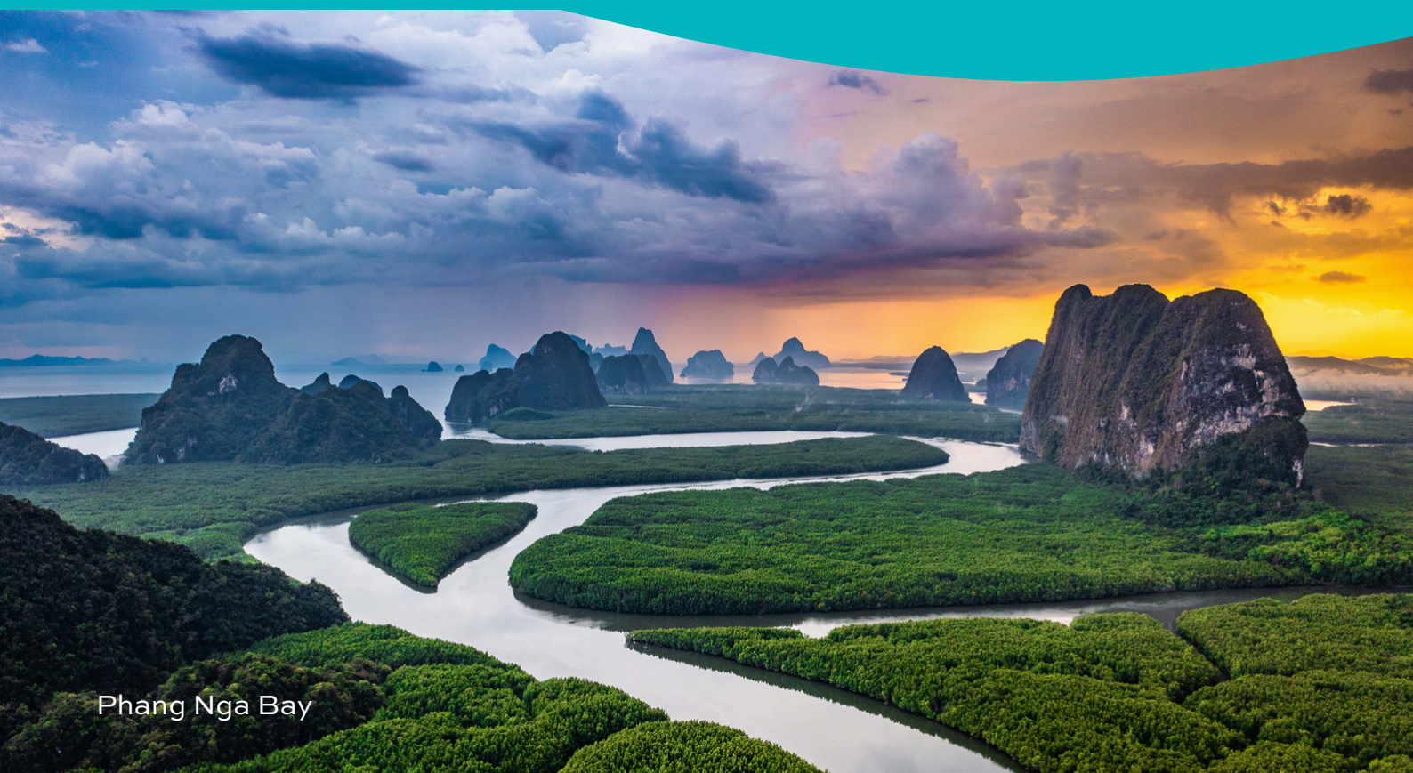
Phang Nga Bay

For more inspiration, check out of 8-day Phuket Sailing Itinerary